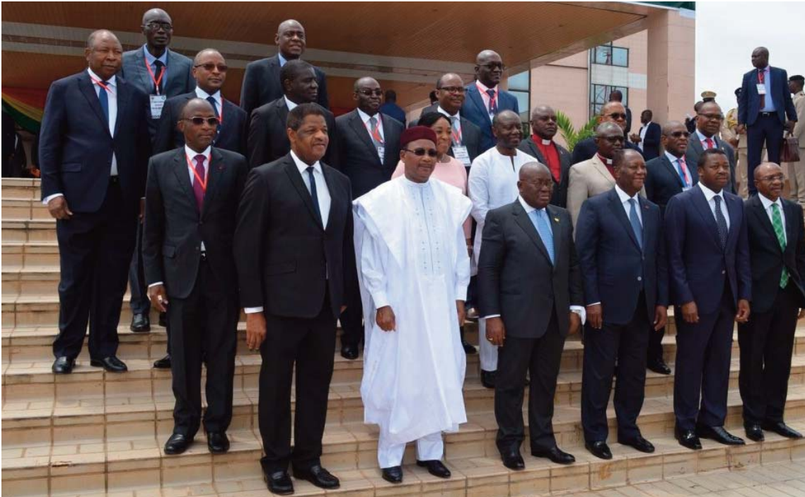
Fifth meeting of the Task Force on the common currency project in Ghana on february 21st.